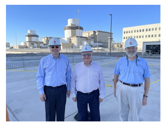
Vogtle Units 3 and 4 in background

On Thursday, November 30, President Petersen visited the Savannah River National Laboratory. SRNL led tours of its laboratory and large-scale nuclear material facilities, followed by driving tour of the Savannah River Site. Ken visited the SRNL radiological and large-scale process development facilities including the shielded cells and the Engineering Development Laboratory. The site tour included historic and present operating sites of M area (historic production reactor fuel manufacturing); K area (Pu materials storage); L area (DOE spent fuel storage); the SRNL Mobile Melt Consolidate facility; H-Canyon (fuel processing); H-Tank Farm (high level waste handling and storage); Tritium facilities; Salt Waste Processing Facility; the Salt Disposal Units; the Defense Waste Processing Facility; the Glass Waste Storage Buildings; and E-Area (radiological waste disposal). Lunch discussions were held with SRNL staff to focus on SRNL's leading work on processing and waste form development that could meet needs for advanced reactor fuel cycles.