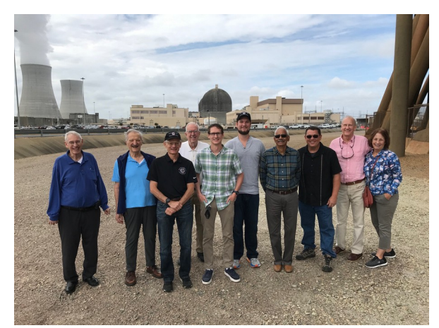
Section attendees with Vogtle Units in background (not pictured Mike McCracken)

The local section visited the expanding Plant Vogtle site on October 6th. Eleven section members went to Vogtle in Burke County, GA for lunch and to get an update on Unit 4, the only unit in America presently under construction. Mike McCracken, Communications Coordinator for Southern Nuclear Company, was the host and guided the group around the site on a tour. The section had not toured the site in four years. This included an overview of nuclear energy, Southern Nuclear/Plant Vogtle, and the status of Units 1 and 2 (approximately 35 years of operation) and Units 3 and 4 (Unit 3 became the 93rd US operating nuclear plant July 31 and Unit 4 is expected to be commercially operational first quarter 2024). Included was a presentation with group discussion, viewing of models and exhibits, and then a perimeter driving tour of the site (which included stepping out of vans by the Unit 1 cooling tower and on Mt Vogtle where the group had an elevated view of Units 1 - 4 plus some of the Savannah River Site's facilities).